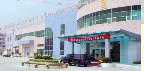
Above: the dormitory block at Shenzhen. Left: view of the front reception area.