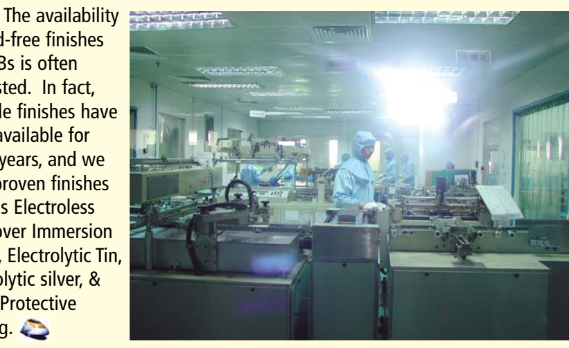
Copper and other proven finishes are available along with lead-free and protective coatings.

of lead-free finishes on PCBs is often requested. In fact, suitable finishes have been available for many years, and we offer proven finishes such as Electroless Gold over Immersion Nickel, Electrolytic Tin, Electrolytic silver, & Entek Protective coating.