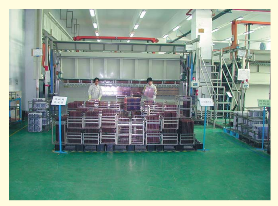
Plating tanks as big as your living room in the newly installed High Capacity Plating plant!